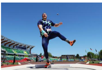
Crouser smashes world shot put record with 23.37m in Eugene